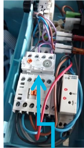
Non modular units: disconnect red cable or use cleaning switch If available.