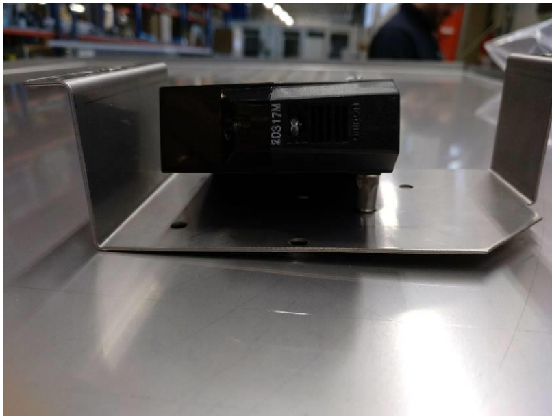
In the SC units, it has more angle